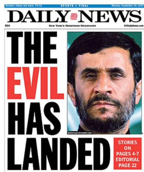
Figure 2: Name calling .

reductio ad Hitlerum flag-waving minimisation exaggeration intentional vagueness black-and-white fallacy appeal to prejudice whataboutism bandwagon causal oversimplification appeal to authority obfuscation name calling cognitive dissonance loaded language thought-terminating clichés labeling