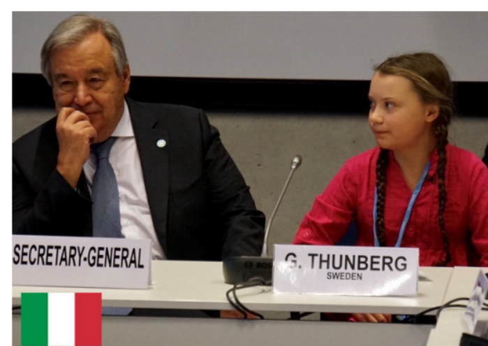
Figure 3: Appeal to fear (Can you spot another example in this poster?)

Greta Thunberg: “We are in the middle of the sixth mass extinction, with more than 200 species getting extinct every day”