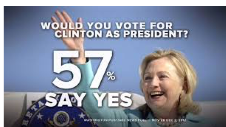
Figure 1: Bandwagon : join in because everyone else is taking the same action.

reductio ad Hitlerum flag-waving minimisation exaggeration intentional vagueness black-and-white fallacy appeal to prejudice whataboutism bandwagon causal oversimplification appeal to authority obfuscation name calling cognitive dissonance loaded language thought-terminating clichés labeling